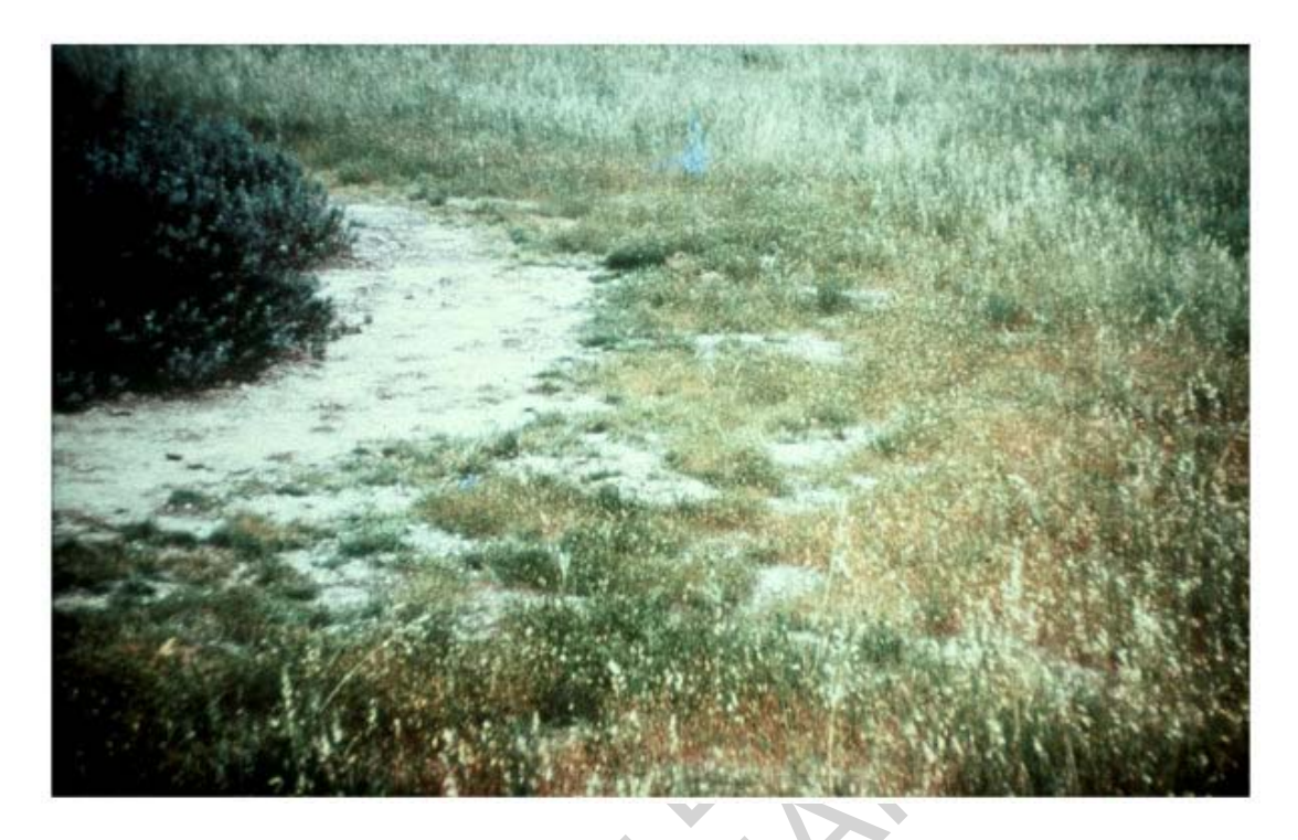
Table 1. Allelopathic compounds found in plants.

Figure 2. A unique pattern of herb exclusion by a California chaparral species, Salvia leucophylla , exhibiting a bare zone of 1 to 2 meter wide close to the shrub (A), an inhibition zone about 3 to 4 meters wide (B) next to the bare zone, and a normal growth of herbaceous plants beyond the inhibition zone.