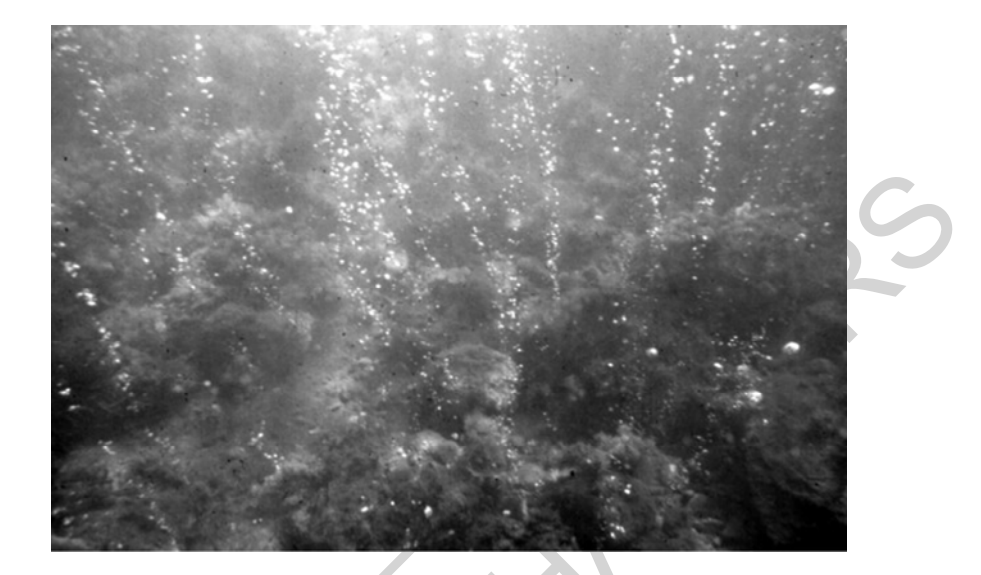
Figure 3: Outgassing at a shallow submarine hydrothermal system, Porto di Levante, Vulcano, Italy. Sea bottom about 6 meters deep

hyperthermophiles had been discovered at this place, some members of which were found later to exist in other shallow and abyssal marine hydrothermal systems, too (see below; e.g. Table 3). A further recently discovered shallow submarine hydrothermal system is located at a depth of 105 meters at the Kolbeinsey Ridge ( 67^{\circ}05'29''N ; 18^{\circ}42'53''W ) which represents the northern continuation of the Mid Atlantic Ridge. It had been visited first by the German diving vessel Geo . Hot fluids with temperatures between 40 and 131^{\circ}C and pH 6.5 are venting out from cracks and holes at the sea floor.