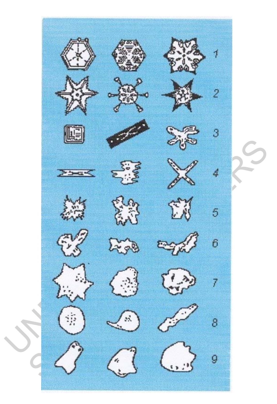
Figure 2: International classification of frozen precipitation. 1-Thin hexagonal plates; 2 -Dendritic crystals, 3-columns; 4-needles; 5-dendritic forms; 6-incorrect crystals; 7-snow pellets (graupel); 8-freezing rain; 9-hail.