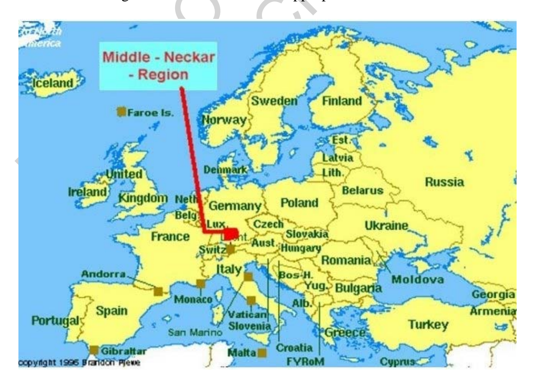
Figure 1: The Middle-Neckar region in relation to Europe

However, the notion Middle-Neckar region is mostly used in this contribution since it refers directly to the links between the region and the river. Since a river passes boundaries, and the river Neckar is the focus of the present chapter, other parts of the Neckar basin will be given due attention where appropriate.