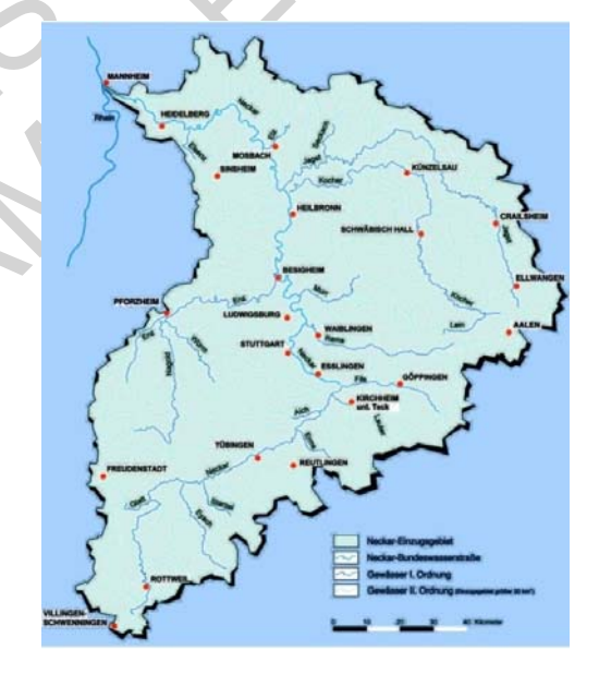
Figure 3: The catchment area of the river Neckar

The specially marked catchment area of the river Neckar - as shown in Figure 3 - forms along its south-eastern boundary the European Watershed between the Rhine and the Danube Rivers.