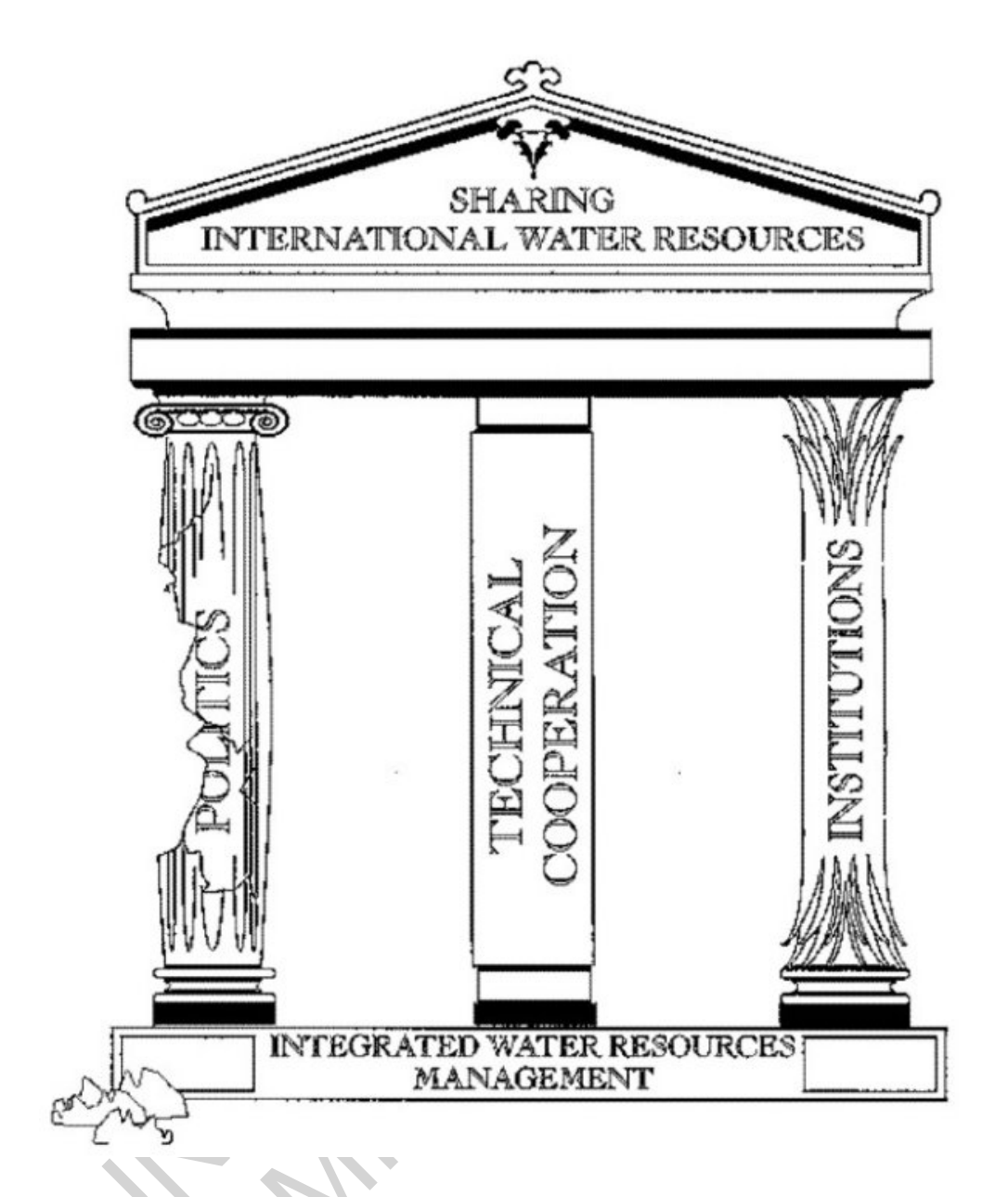
Figure 2. The Political Pillar may easily Crack!