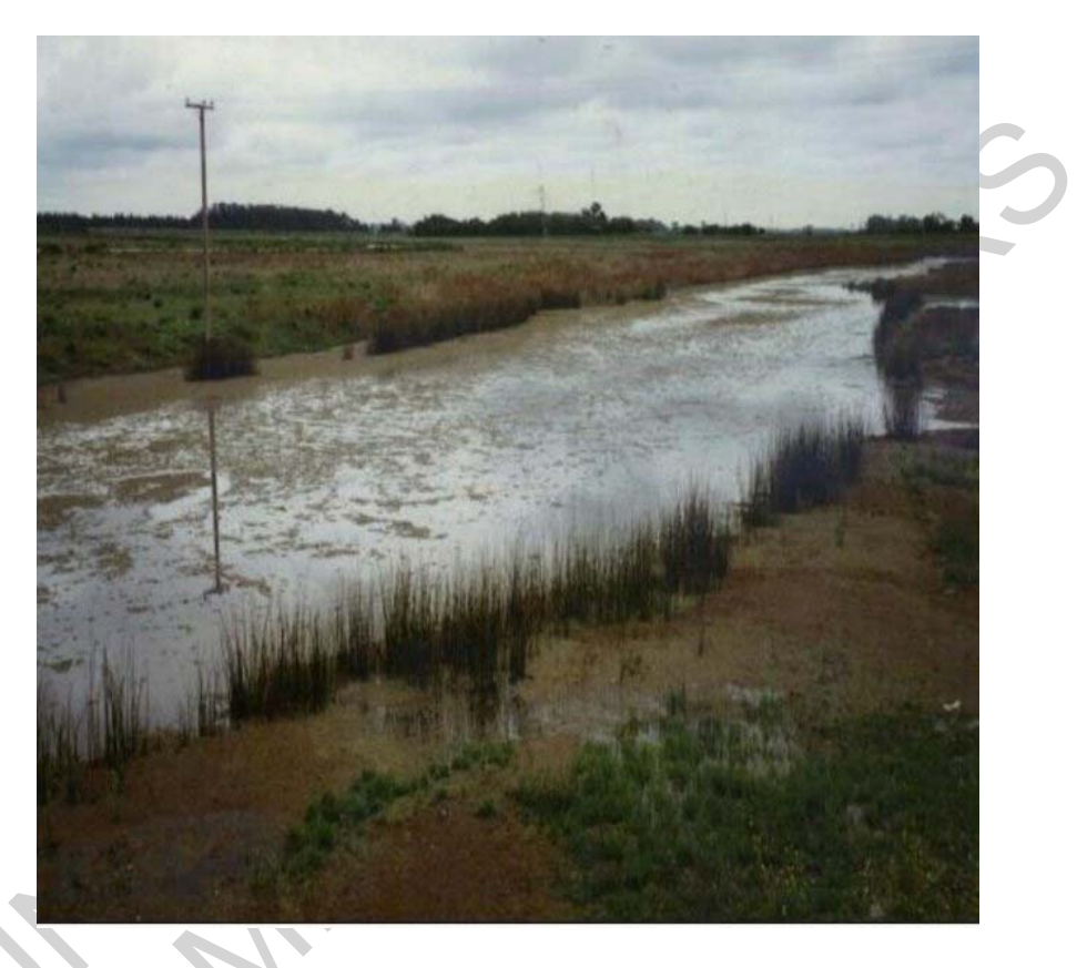
Figure 2: Different eutrophication stages of Bitel Creek, Chascomús Argentina

Groundwater pollution by phosphates is not very important, as these tend to remain fixed to soil particles, but phosphates may reach surface waters through erosion. Phosphorus in these waters is frequently the limiting nutrient and its presence in levels as low as 50 \mu g.L<sup>-1</sup> (ppb) produces eutrophication. In these conditions, blue-green algae grow in excess, depleting oxygen supplies in water, as shown in Figure 2.