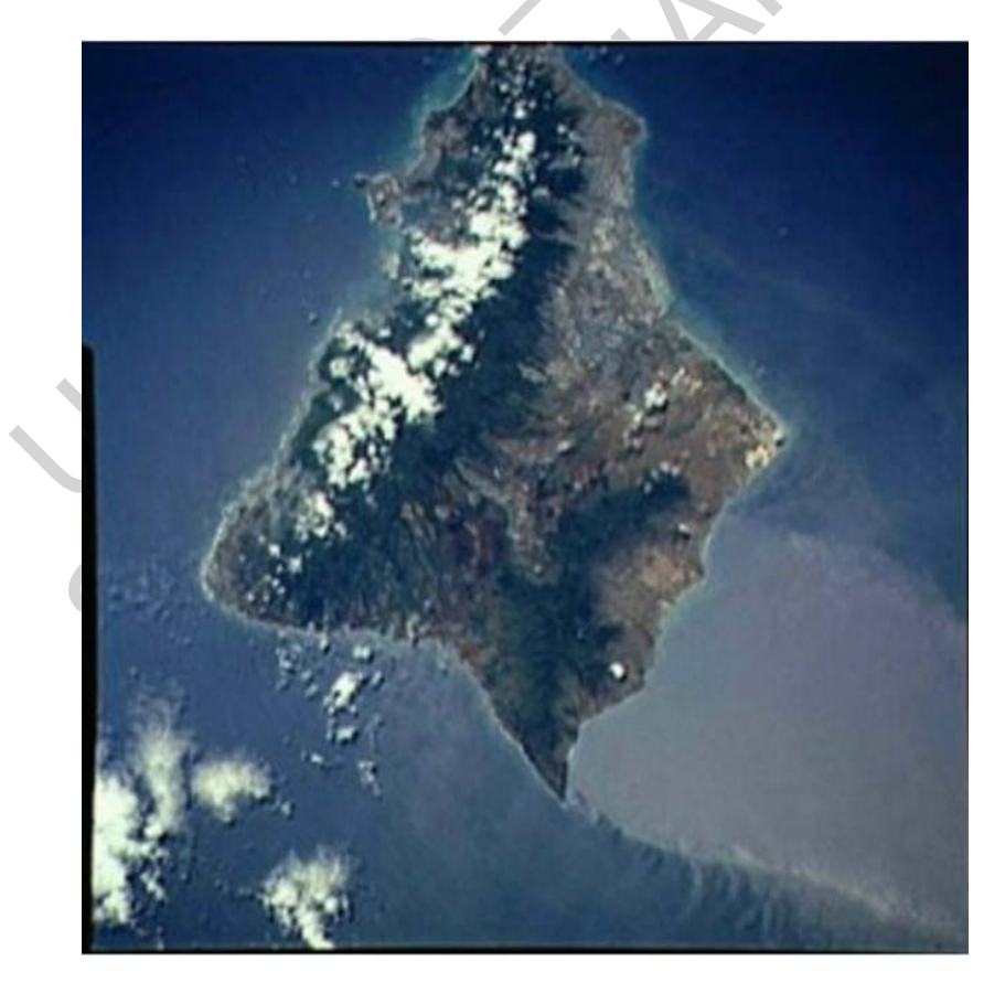
Figure 1. Aerial view of the volcanic island of Oahu in the Hawaiian Island chain This is an example of a primary coastline created by volcanic processes. Photograph

Crucial in understanding how temperatures will impact species is the knowledge of species tolerance ranges and the effect of climatic parameters. With increased global temperatures, it is estimated that Earth will respond with more frequent hot periods, with coastal areas becoming hotter and in some places drier. This will have significant impact and import for the survival of plants and animals in shallow waters. The hotter and drier periods will lead to increased salt concentrations and water temperatures higher than 30 °C. Furthermore, as temperatures increase, wind strength and direction will be altered, and the increased likelihood of extreme events occurring and their frequency will control populations (and recovery) in ecosystems. As throughout geologic history, migration and colonization of new species will in part be controlled by the rate of climate change. See Atmosphere and Climate.