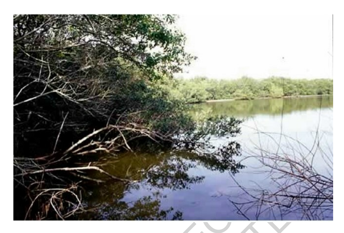
Figure 4. A low-gradient, low-energy, mangrove-fringed coast located in the southeast of the United States.

Wave-erosion coasts are delineated by the coastline or boundary between the shore and ocean (foreshore), which is exposed at low tide and submerged at high tide, and backshore, which extends from the normal high-tide shoreline to the coastline. The beach consists of the wave-worked sediment and extends from the coastline to low-tide line. Wave erosion of the coast produces voluminous amounts of sediments that are both carried inland and deposited on the coast or carried away by longshore movement of water. Sediment that will eventually make up the beach is carried by a current moving parallel to the shore between the shoreline and the breaker line (called longshore currents). The amount of longshore drift in any coastal region is determined by the balance between erosional and depositional forces. When this equilibrium is altered, the dominant force will prevail, allowing either more erosion or deposition to the coastal zone.