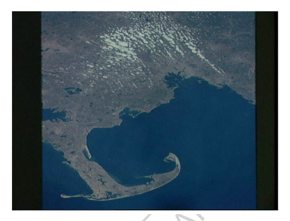
Figure 2. Aerial view of Cape Cod

Other types of subaerial deposition coasts include those under the influence of wind deposition, forming dunes and sand flats. Parts of the Earth's primary coastlines have been formed by lava flows (example, Hawaiian Islands) and by volcanic collapse (atolls).