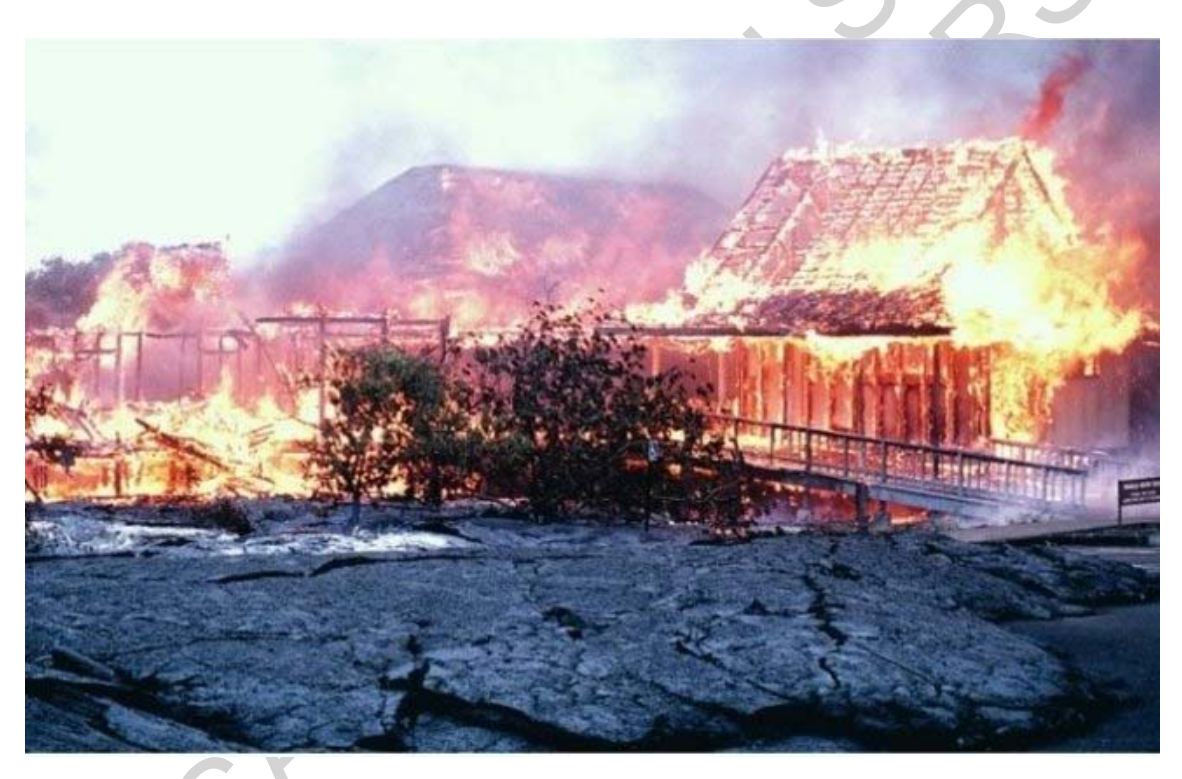
Figure 1. Waha'ula visitor center in Hawaii Volcanoes National Park burns from an advancing lava flow in 1989

The impact of volcanic eruptions, one of the most powerful display forces of nature, was poorly understood until recent developments in volcanology. The impact of large eruptions on climate is a major reason that an understanding of volcanic phenomena is important for society today. The relationship between people and volcanoes is as old as the human race. Sometimes eruptions can be a catastrophically destructive force and greatly influence changes of global environment. Every year, about 50 volcanoes throughout the world are active above sea level, threatening the lives and property of millions of people. Ash fallout from large-scale explosive eruptions can cover large areas of Earth. Eruptions can produce such features as floods, pyroclastic flows, and mudflows that can cause major loss of life and property burying towns and villages within minutes (Figure 1). Eruptions can rapidly change productive landscapes to virtual deserts. The number of people living in volcanic areas is growing and impact of volcanic eruption on humans will be evaluated next.