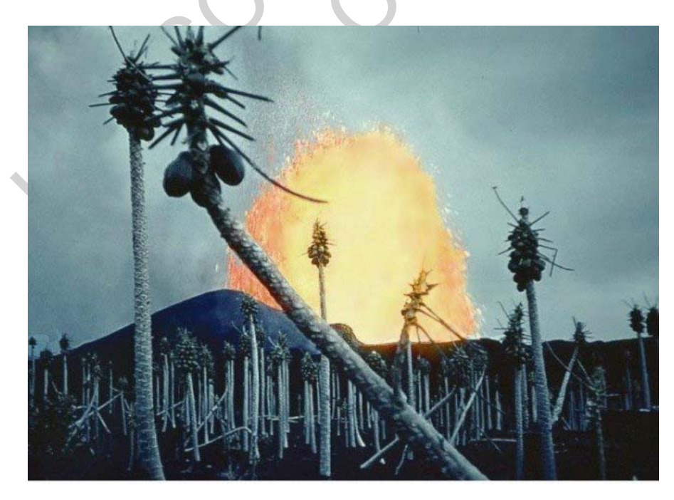
Figure 3. Defoliated plants after the 1960 Kapolei eruption of Kilauea volcano, Hawaii

Figure 2. Pyroclastic flows descends the flank of Mayon volcano, Philippines