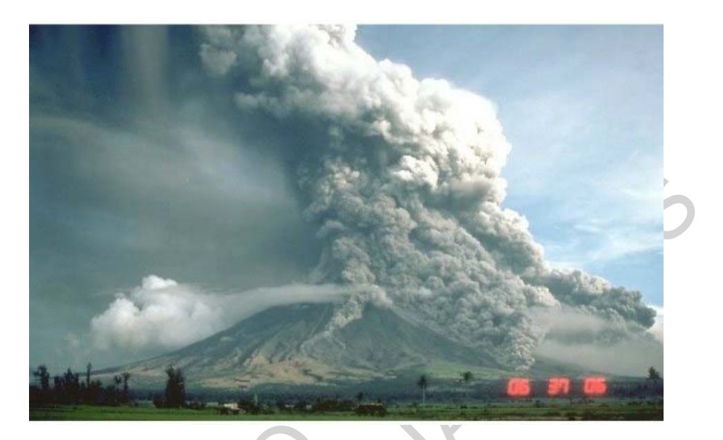
Figure 2. Pyroclastic flows descends the flank of Mayon volcano, Philippines

spectacular, and even deadly fireworks, volcanic eruptions have not been nature's most deadly hazard in living memory. Over the period 1947–1981, the average number of deaths per volcanic disaster totaled 525; this compares with 190 in landslides, 856 due to tsunamis, and 2652 during earthquakes. Between 1980 and 1990, around 620 000 people were affected by volcanic activity compared, for example, to over 28 million affected by earthquakes, and 525 million by floods.