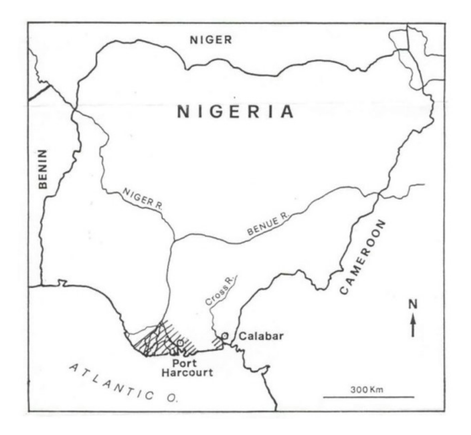
Figure 2. Map of the Federal Republic of Nigeria, showing the main industry centers for oil and natural gas production and transmission

Unfortunately, this important region is currently threatened by the highly developed oil and natural gas industry installations. Indeed, Nigeria is the top-ranked oil and gas producer of sub-Saharan Africa and the sixth of the world, and much of this highly developed industry is concentrated in the extreme south of the country (Figure 2), where there is contextually one of the main rain forest blocks of West Africa, the largest mangrove forest block of the whole continent, and an unique type of coastal forest called "island-barrier forest." Oil-related industry installations are often situated inside rain forest and mangrove patches, and pipes and access roads contribute further to natural habitat destruction. Moreover, there are still strong risks that industrial effluents can contaminate wastewater because of the habit of some people (especially in western Niger Delta) to broach oil transmission pipes and sell oil and fuel on the black market. Indeed, these broaching operations have already caused some dramatic accidents and the death of hundreds people in the years 1998–2000.