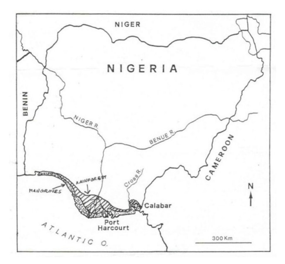
Figure 1. Map of the Federal Republic of Nigeria, showing the main forested blocks (including both mangrove forests and tropical dry- and swamp-forests)

The rain forest block of southern Nigeria (West Africa), concentrated mainly in the regions of Niger Delta and of Cross River State (near the political border with Cameroon), is an important center of endemism for many faunal and floral groups (Figure 1). Only during the recent years, and just to limit our attention to the order Primates, two endemic monkey taxa ( Cercopithecus sclateri and Procolobus badius epieni ) have been discovered, in addition to the other important endemic drill Mandrillus leucophaeus , and possibly a new subspecies of gorilla and the chimpanzee.