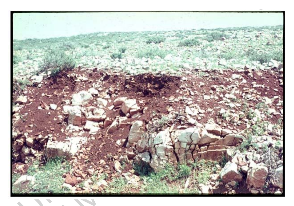
Figure 2: Hard limestone with numerous joints and dissolution holes, allowing the water to infiltrate into the soil substratum

Physical and chemical weathering processes are often slow and it takes time before their effects become visible. Time as a soil forming factor is, therefore, closely related to the combined effect of climate, parent material and human activity. The longer the time chemical weathering, leaching and clay migration can operate in a soil, and the less the soil is affected by erosion or by Man, the more advanced will be its development.