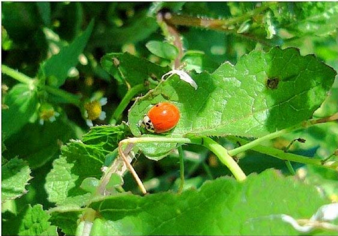
Figure 2. Ladybeetle (Coleoptera: Coccinellidae).

The active search for prey can be other than randomly, that is, in a directed manner. For this the predators use several signs left in the environment by their prey: it could be volatile substances released by the prey or by the plant attacked; it also could be sounds produced by the prey, as well as light stimuli (vision), tactile and the sense of smell. Usually, the directed search is more developed in parasitoids, or it could be stated that it is more studied in these organism, and, though it is less known in predators, some examples are found in very specialized predators.