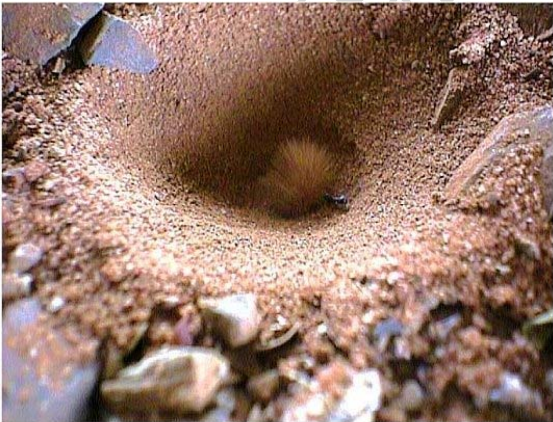
Figure 1. Loose soil funnel constructed by the ant-lion larva to capture its preys.

Many predators, however, adopt active strategies for hunting their prey, instead of sitting and waiting or building traps. The organisms that adopt this strategy maximize energy expenditure, since the active search is much more energy consuming, however, they save immensely in time spent to find the needed resource. There are two possibilities of active search: random or directed.