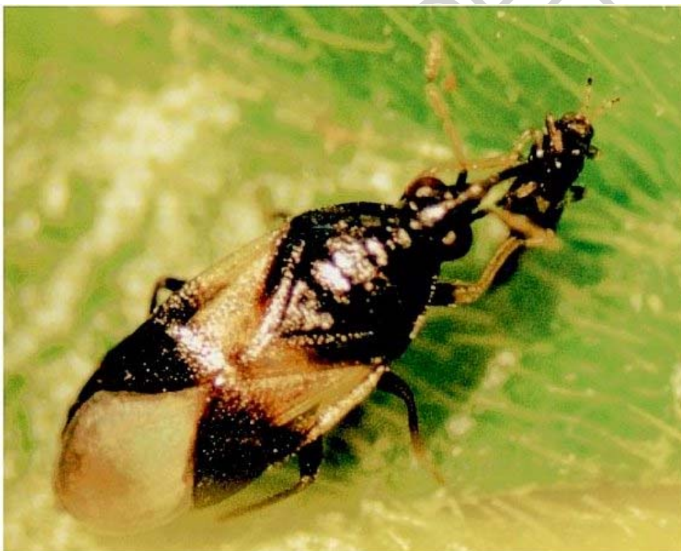
Figure 3. Piratebug Orius (Hemiptera: Anthocoridae).

Some typical families of phytophagous stink bugs, with four-segmented rostrum, have important predator examples. This is the case of the genus Geocoris in the family Lygaeidae, which is a predator of small insects, but presents a four-segmented rostrum. The same is found in representatives of the tribe Asopini in the family Pentatomidae, where the genera Podisus , Tynacantha and Auchaeorrhynchus are soybean stink bug predators. Therefore, it is possible to find quite important stink bug predators with four-segmented rostrum.