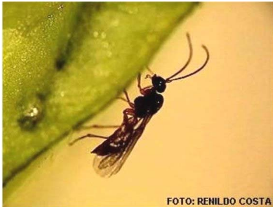
Figure 5. Braconid parasitoid wasp.

TO ACCESS ALL THE 43 PAGES OF THIS CHAPTER, Visit: http://www.eolss.net/Eolss-sampleAllChapter.aspx