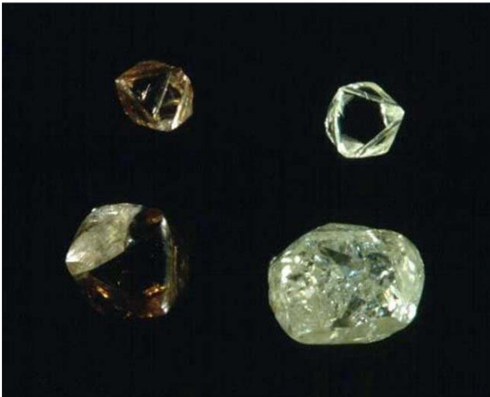
Figure 1. Raw diamonds, South Africa

Among naturally occurring materials, diamond is characterized by extraordinary physicochemical properties. From a crystal chemical point of view, diamond is the high-pressure, cubic form of carbon (space group Fd\bar{3}m , class m\bar{3}m ), which is stable in the Earth at depths greater than ca. 120 km at 800 °C, increasing to greater than ca. 170 km at 1400 °C. It usually crystallizes as colorless or pale yellow to orange, brown, gray, or black octahedra, cubes, dodecahedra, and combinations of these forms. Twinned crystals may exhibit a flat habit known as “macle” and partially etched grains may appear rounded. Rarer colors are pink, red, green, blue, and violet. Diamond is a superb heat conductor and an excellent electrical insulator, although the gray-to-blue variety known as type IIb behaves as a semiconductor. Its extreme hardness (10 Mohs scale; 56–115 GPa Knoop Hardness Number), elevated melting point (3550 °C), very low reactivity to chemicals, and high refractive index (2.417), which confers it a prominent, adamantine luster, intense light dispersive properties, and great durability, make it one of the most sought-after industrial minerals and most appreciated gems.