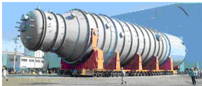
Photo 7. Pressure vessel