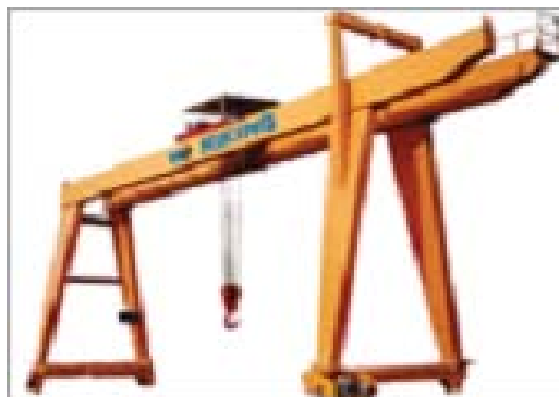
Photo 3. Crane