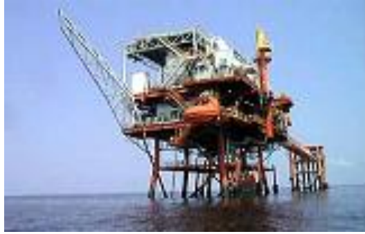
Photo 4. Offshore platform