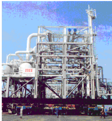
Photo 6. Chemical plant