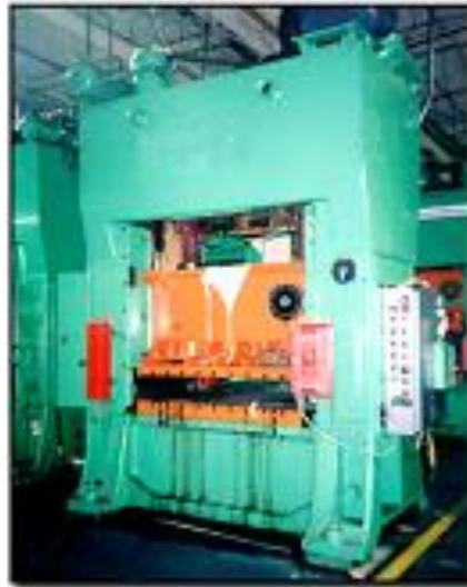
Photo 2. Press frame