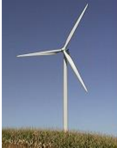
Photo 1. Wind turbine tower