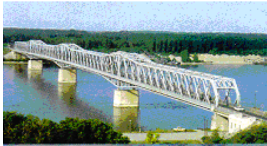
Photo 5. Bridge