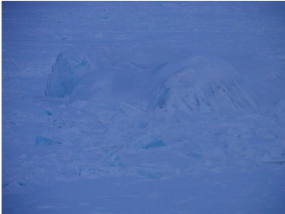
Figure 3. Capsized iceberg (East of Svalbard), seen from the bridge

When sailing in ice a marked level stick attached on deck is helpful for estimating the ice thickness. The distance between the marks must be adapted to the location of the stick above the waterline and the observer’s position on the bridge.