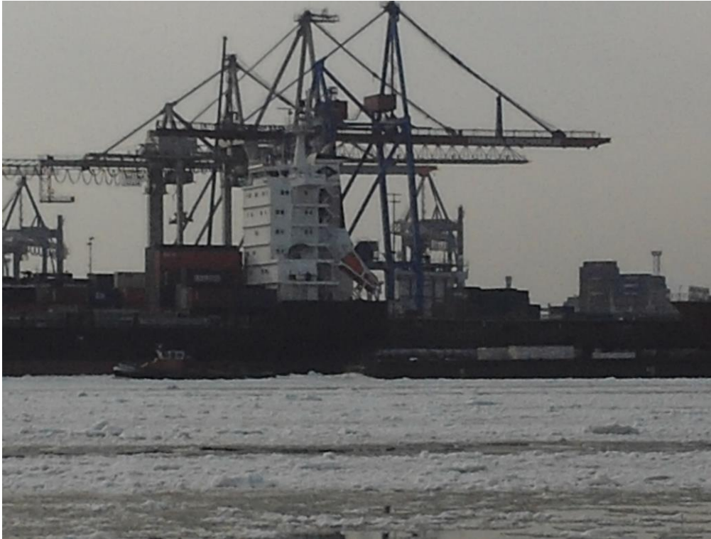
Figure 1. River Elbe with brash ice Feb. 2012