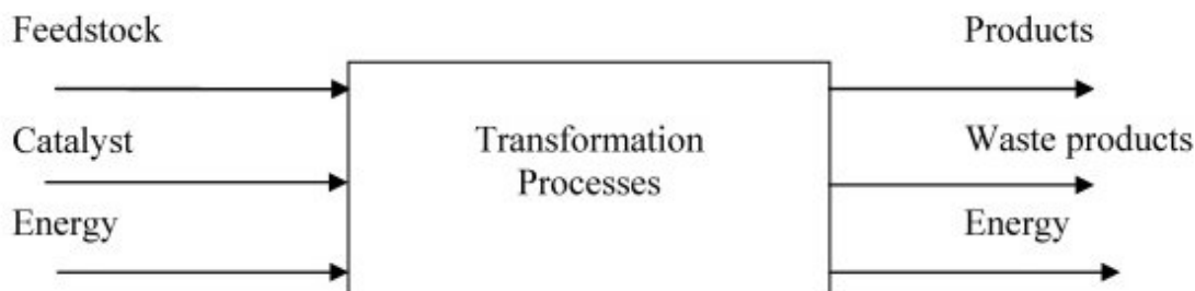
Figure 1. Chemical Process Schematic

Chemical processes fundamentally transform raw materials into more useful products that are consequently of higher value. In its simplest form a chemical process consists of a series of material and heat flows which can be represented by a simple model as shown in Figure 1: