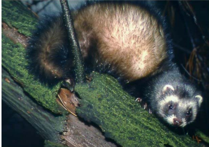
Figure3. The polecat, Mustela putorius

Western European Mustelids are typically terrestrial, e.g., the weasel ( Mustela nivalis ), the stoat ( Mustela erminea ) and the polecat ( Mustela putorius ) [Figures 1, 2 & 3 respectively].