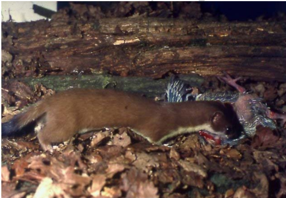
Figure2. The stoat, Mustela erminea

The Mustelidae therefore contain some well-known species and the success of these species demonstrates the evolutionary principle of adaptive radiation . Early forms of mustelid lived in forests and were less specialized, but as they evolved they diversified into more highly specialized species with the ability to exploit a variety of contrasting environments.