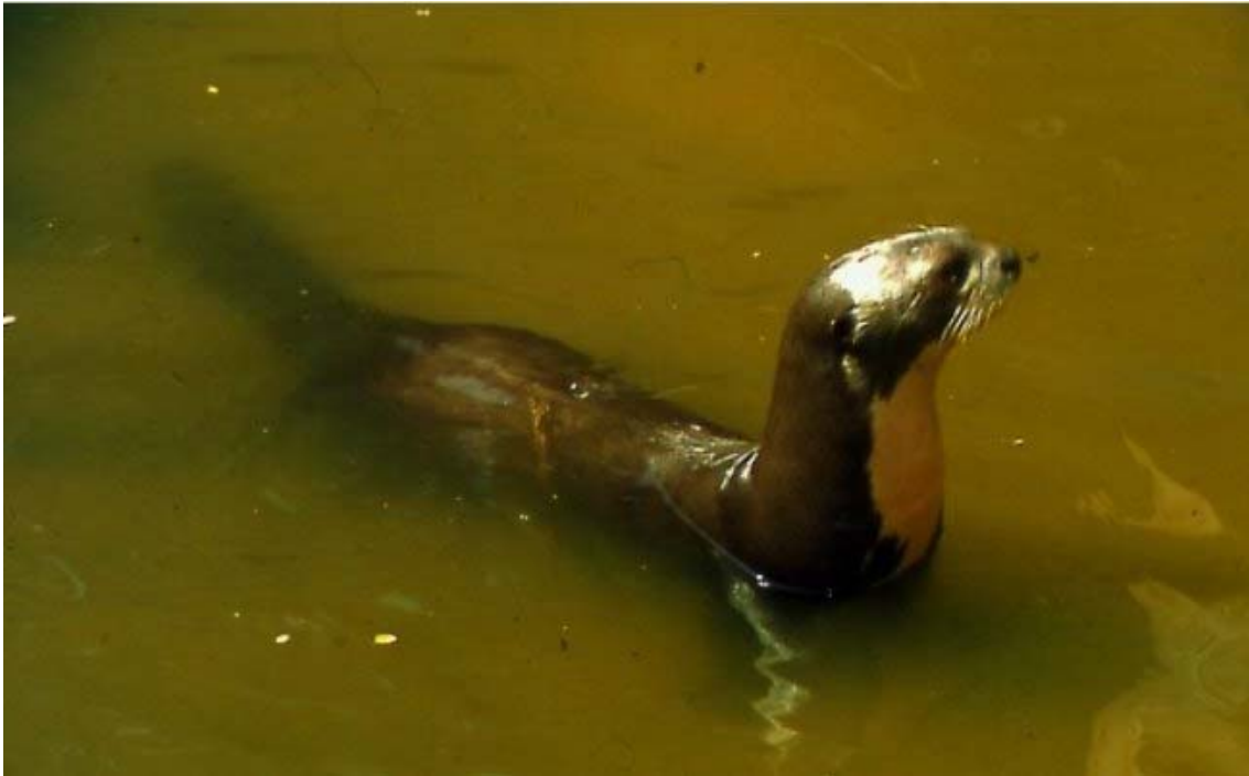
Figure 7. The giant otter, Pteronura brasiliensis

Mustelids have a typically solitary nature (although there are exceptions, e.g., the Giant otter, Pteronura brasiliensis (Figure 7) and individuals are generally territorial.