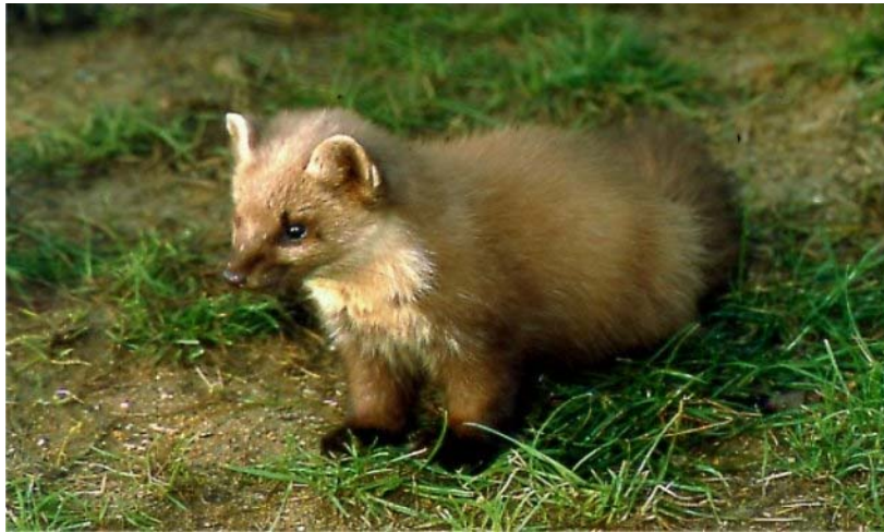
Figure5. The pine marten, Martes martes

The Pine marten, Martes martes (Figure 5) is mainly arboreal and an adept climber, perfectly at home in the trees of more northern European forests, although in Britain it happily exists in rocky and more open environments. The Pine marten's closest European cousin is the Beech marten, Martes foina . It has similar adaptations and its range overlaps with that of its cousin, however it does not compete, as it prefers deciduous woodland and more cultivated areas. Additionally, it has a more southerly distribution.