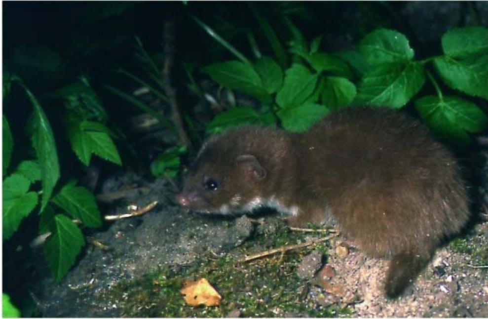
Figure1. The weasel (juvenile), Mustela nivalis