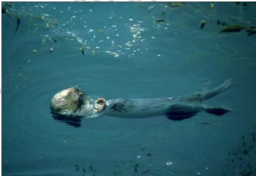
Figure6. The sea otter, Enhydra lutris

Other highly specialized Mustelid species include the otter, which is remarkably adapted to its semi aquatic existence. Examples include the European otter, Lutra lutra (see Section 3, Figure 9), quite at home on land, but only when observed in water do its adaptations to this quite different environment become apparent. In contrast the Sea