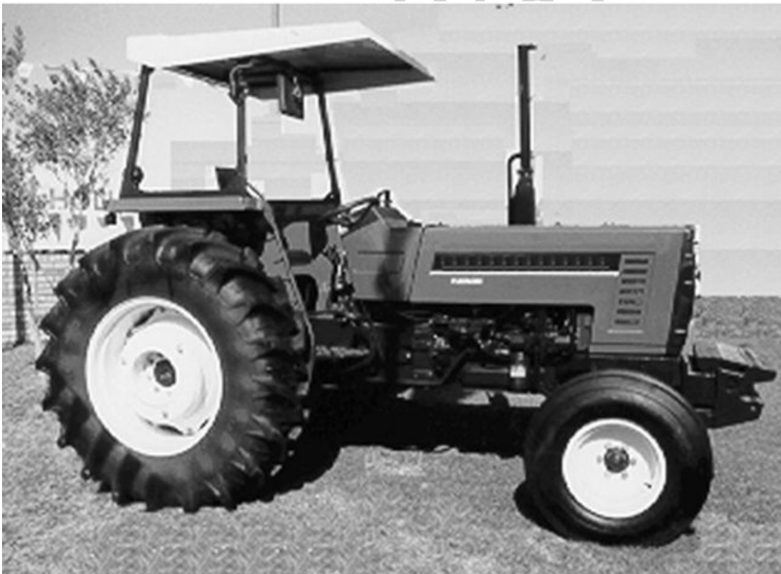
Figure 1. Standard row-crop tractor with wide front axle

Tractors, originally used mainly for plowing and threshing, were soon replaced by general-purpose row-crop models. The tricycle configuration of the 1940s was replaced by center-pivoted wide front axles (Figure 1) and special orchard models with a narrow wheel spacing were introduced.