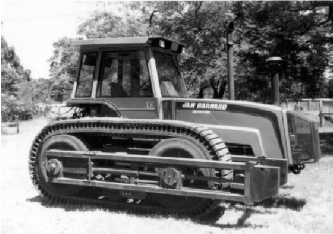
Figure 3. A prototype drive system and track developed by Dr. Jan Barnard

In Europe, tractors for special applications—the "Euro-Trac" and mid cab "Zylon" or high-speed tractor ( 40 \text{ km h}^{-1} ) for road use by JVC, Carrero, and Deutz—are available but the "standard tractor" with smaller driven front wheels (Figure 2) will probably remain the leading concept.