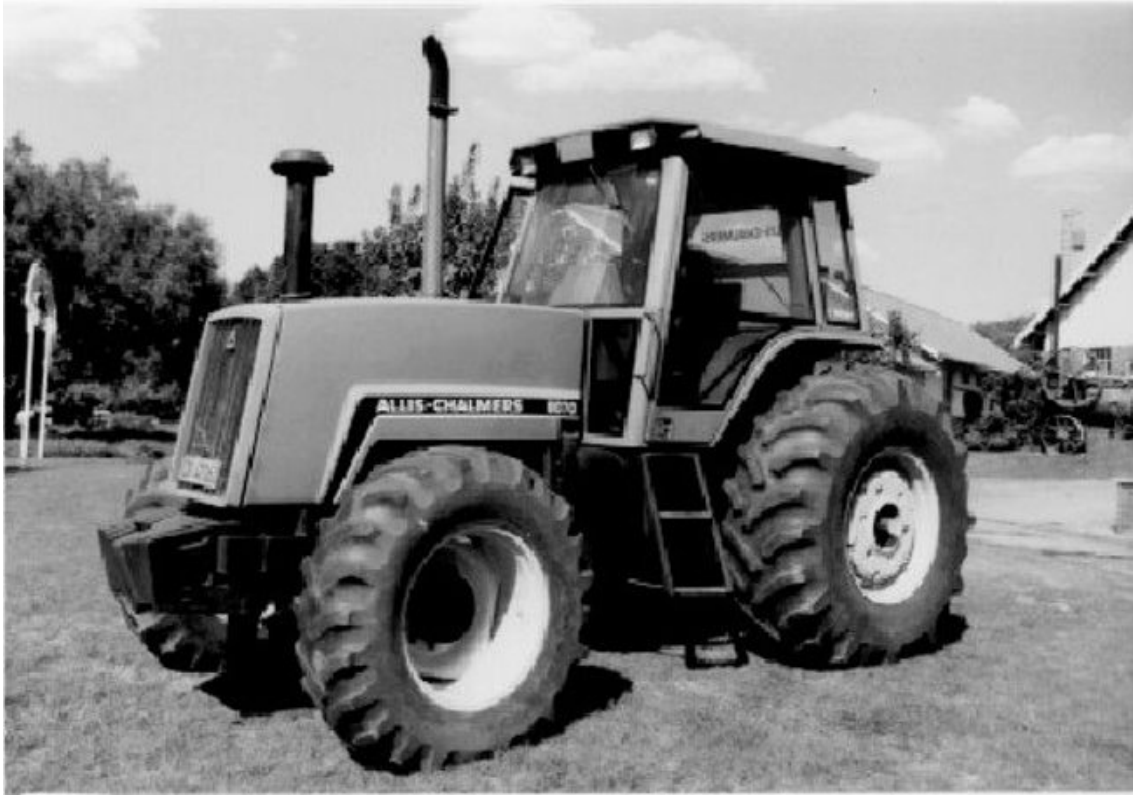
Figure 2. Two-wheel-drive tractor with optional mechanical front-wheel assist

Row-crop tractors were also equipped with optional front wheel drives (Figure 2). Four-wheel-drive tractors with four, six, or eight wheels and articulated steering are at present common for heavy draft applications. A rigid tractor frame with front, rear, or crab steering is also possible.