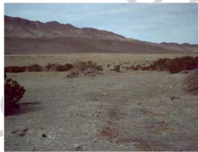
Figure 2. Sample of desert landscape at drier climate condition in northern Argentina. Rodrigues 2003.

Deserts occur in specific latitudes (5-35° north and south of the equator) because of the general thermodynamics of our planet. Solar radiation hits the earth with highest intensity near the equator. Because the earth's axis is tilted 3.5° with respect to the plane of its orbit, during part of the year the zone of maximum solar interception shifts northwards, towards the Tropic of Cancer, and during part of the year it moves southwards, towards the Tropic of Capricorn. Thus, the warm tropics form a belt around the equator from latitude 3° north to latitude 3° south called Intertropical Convergence Zone, where the tropical heat generates rising, unstable air.