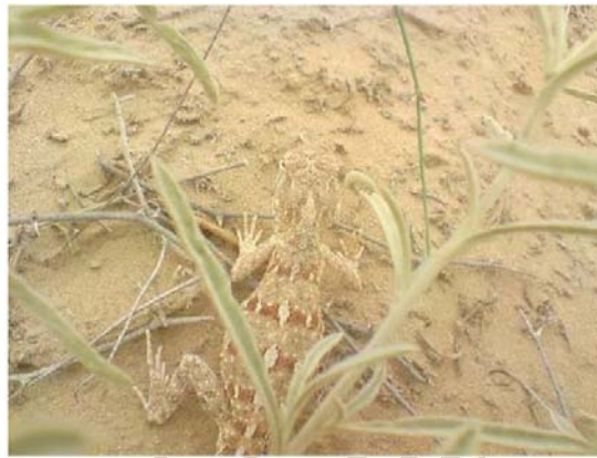
Figure 3. Lizard looking for food in Cholistan desert (Pakistan). Ahmad, 2008.

Plants and animals are involved in ecological cycle of tropical deserts. The strength of some desert-areas animals come from eating plants of the same area of them. However, those plants have some defensive mechanisms like sharp spines and chemical-laden leaves which are used to discourage vegetal-eaters. Most part of animals try to avoid future problems by feeding from seeds that, even easier to eat, are more difficult to find than ordinary desert-plants because of their small size and appearance alike sand grains. Figure 3.