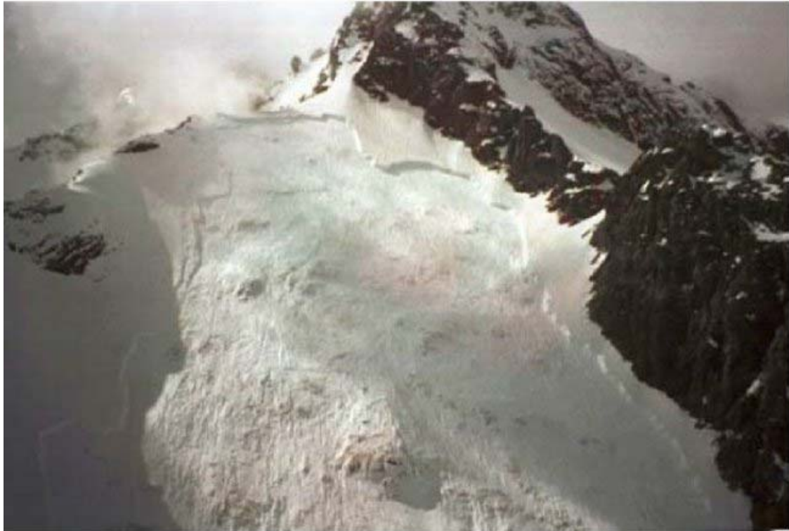
Figure 2. Crownwall and flankwall fracture surfaces are clearly visible in the start zone of Murrells avalanche path that threatens the Milford Highway, New Zealand. The stauchwall at the toe of the slab has been over-run and is not visible.

surfaces outline the slab boundaries after avalanche release (Fig. 2). Tensile failure occurs at the up-slope boundary (the crown-wall ) of the slab, while stress at the lower boundary (the stauch-wall ) is compressive and it fails in shear. A combination of shear and tensile failures occur at the sides and consequently the flank-walls often have a saw-tooth shape (Fig. 2).