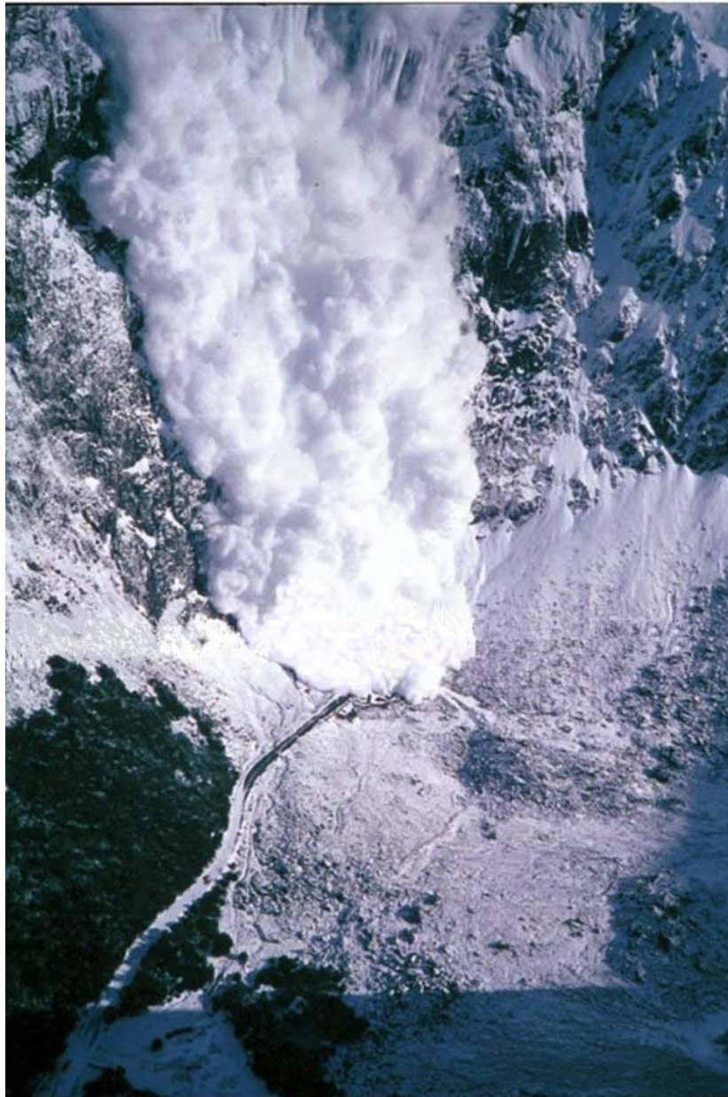
Figure 1. A large snow avalanche triggered by explosives crosses the Milford Highway in the upper Hollyford valley, New Zealand.