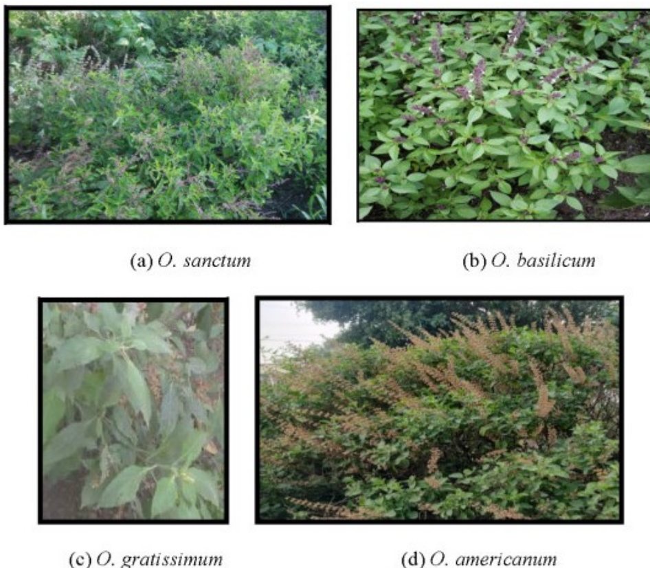
Figure 3. Tulsi ( O. sanctum L.) and Basil ( Ocimum basilicum L.) in the taxonomic hierarchy under Plantae

Tulsi plant is an important symbol of Hindu religion and is worshipped and used in several religious ceremonies. O. basilicum is not just famous for its medicinal applications but also it is best known cooking basil.