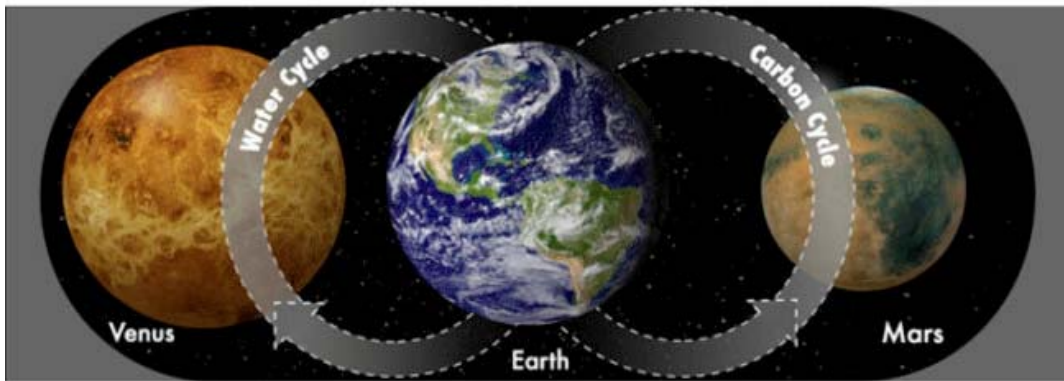
Figure 1. In contrast with its nearest neighbors, Earth hosts highly diversified life

Carbon dioxide (actually carbonic acid) dissolved in rain water slowly but relentlessly attacks rocks through the process of "weathering." The resulting carbonates find their way through rivers to the oceans and the ocean floor, where they slowly accumulate and constitute enormous limestone deposits. Except for the activity of the Earth interior and the constant recycling of the lithosphere (i.e. Earth's crust), carbon would have long disappeared from the atmosphere and oceans, thus making the earth forever sterile for life as we know it. As far as we know, this is what happened on Mars. Earth has active plate tectonics that constantly recycle the lithosphere: no piece of the ocean floor is older than 200 million years.