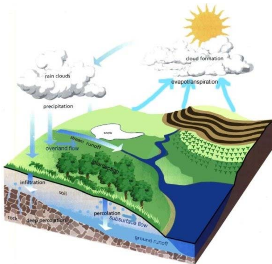
Figure 2. Terrestrial hydrological cycle.

During cold periods a portion of infiltrated water may freeze in the soil. A part of water intercepted by vegetation, accumulated in the land surface depressions, and stored in the soil, may return back to the atmosphere as a result of evaporation. Plants take up a significant portion of the soil moisture from the root zone and evaporate most of this water through their leaves.