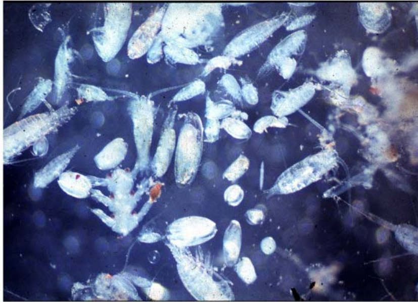
Figure 1. Micrography of a mixed zooplankton sample in which copepods (the elongated semitransparent crustaceans) dominate.

Zooplankton include both predator and prey organisms, although their respective roles are not clearly established, as the early developmental stages of some predators can be the prey of putative herbivores.