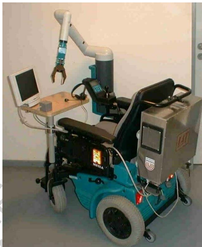
Figure 2. Rehabilitation robot FRIEND I consisting of the manipulator MANUS mounted at a wheelchair

Most of the systems use six revolution joints, a design which is also used in most industrial robots. In rehabilitation robots it is necessary to pay great attention to construction variables such as weight, energy consumption, and security, because they play a much more important role than in industrial design.