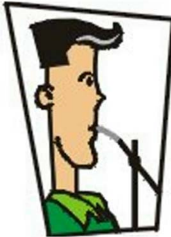
Figure 3a. Breath expulsion