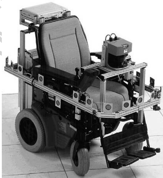
Figure 1. Autonomous wheelchair MAID with ultrasonic sensors and laser scan unit

The mobile basis for assistance systems is normally an electrically powered wheelchair, which usually is equipped with a manual control unit to command direction and speed. The user needs a minimal agility in hands or fingers to control the wheelchair. Although the disabled become experts with very high capabilities to execute difficult tasks, it is often necessary to support them in navigation and obstacle avoidance, particularly if maneuvering in a cluttered or crowded environment. Several research projects worldwide are investigating methods for autonomous behavior of the wheelchair. Figure 1 shows a power wheelchair which is already equipped with additional control elements.